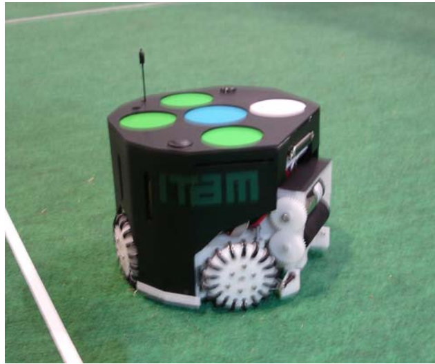
Fig. 1. Small Size League 2005 Eagle Knights robot.

made to our third generation of robots [2] and the way these changes interact with the rest of the components in the system architecture.